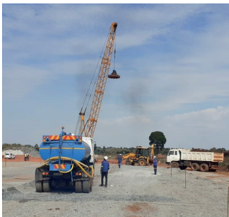
Delmas Waste water treatment works 2022 to 2023 R6.4M