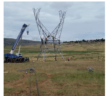
Silimela-manogeng, Duvha-Manogeng and Leseding-Manogeng 400kv Tx Line 2022 to 2023 R4.7M