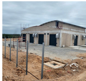
Construction of The East Bank Electrical Main Substation at The Port of Nqura 2021 to 2023 R4.6M