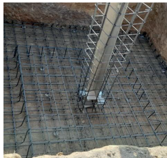
Construction of Ariadne - Venus 400kV Line Foundations 2022 to 2023 R3.8 million